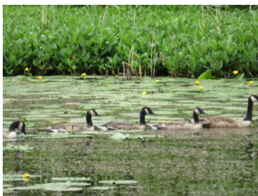
A lovely spot.

Carex = Latin for Sedge, from Greek Kairo = to cut as some species of sedge have sharp angles to their stems.