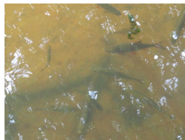
A lovely day.